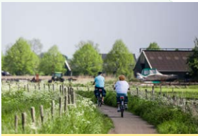
Hollandsche IJssel area