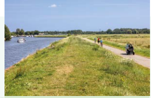
Southern Eem Valley