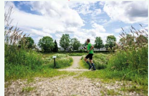
De Roode Haan

The Province, municipalities, water authorities and other Pact partners gain practical experience with Groen Groeit Mee in the example areas. These areas are not theoretical or purely statistical projects, but real places where people live, where learning takes place, and where different parties work together in practice towards a greener province.