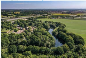
Kromme Rijn area